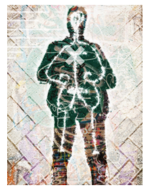
SOMETHING TO SAY